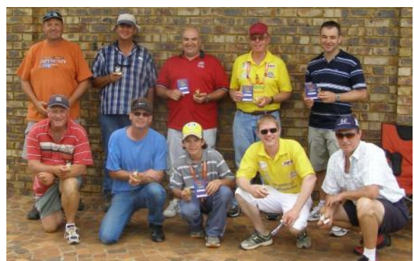
All position winners